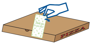
Figure 2: Apply label over the fold/opening of pizza box.