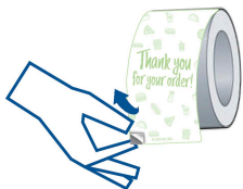
Figure 1: Peel label off the roll.