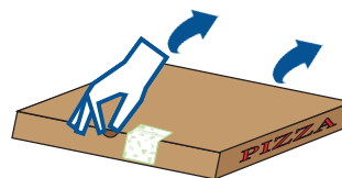
Figure 4: Opening the box rips the label in half.